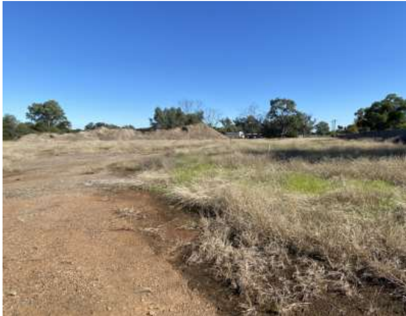
Figure 5: Site photo towards Crawford Street in the west.