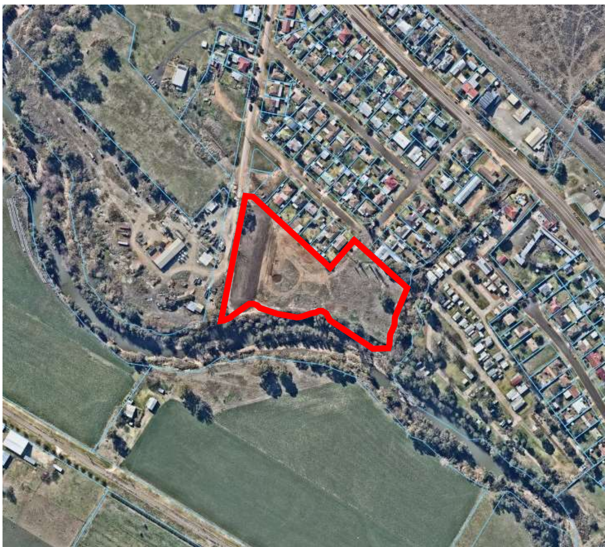
Figure 2: Aerial image of the wider area.

The northern boundary is formed by residential development along Gladys Street and Dayal Street. Crawford Street is located along the western boundary. The southern boundary is formed by the Peel River, with Two Mile Creek located along the eastern boundary.