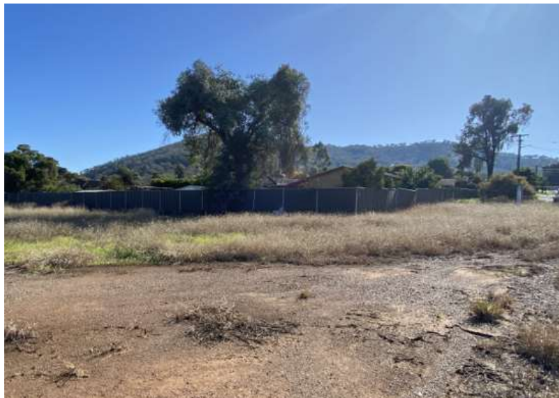
Figure 6: Site photo towards the adjoining development along Gladys Street in the north.