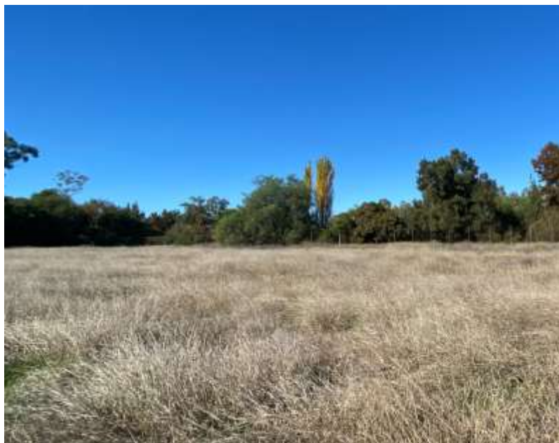
Figure 4: Site photo towards the southern boundary.

A site inspection was carried out on 12 May 2023. Photos from the inspection are included in Figures 4 – 6 below.