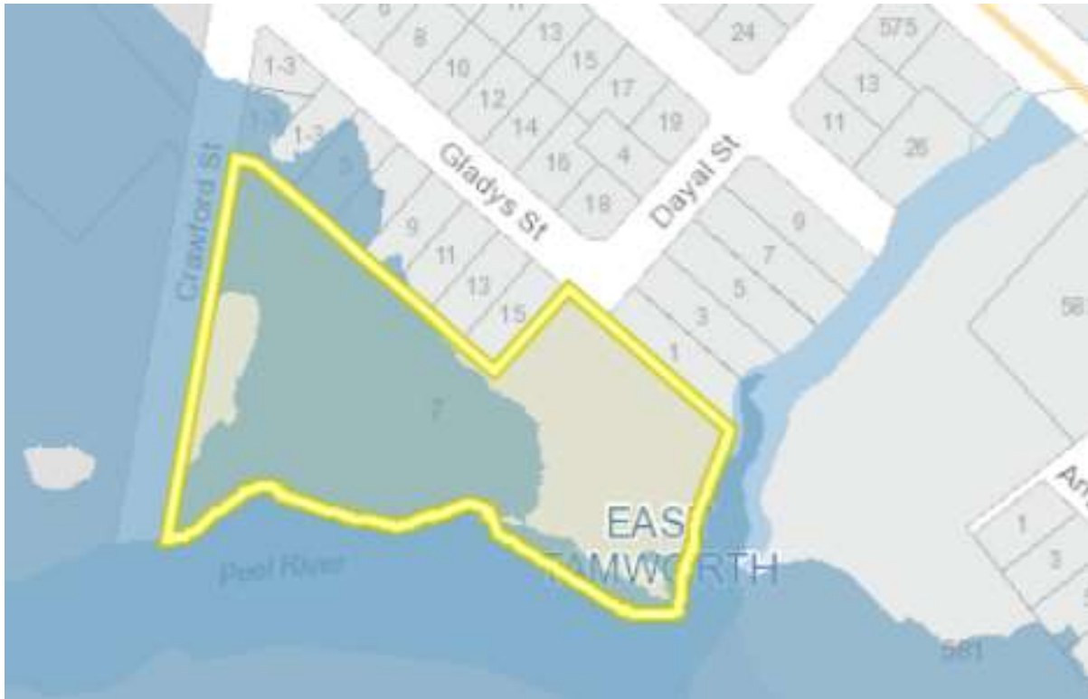
Figure 9: TRLEP Flood Planning Map