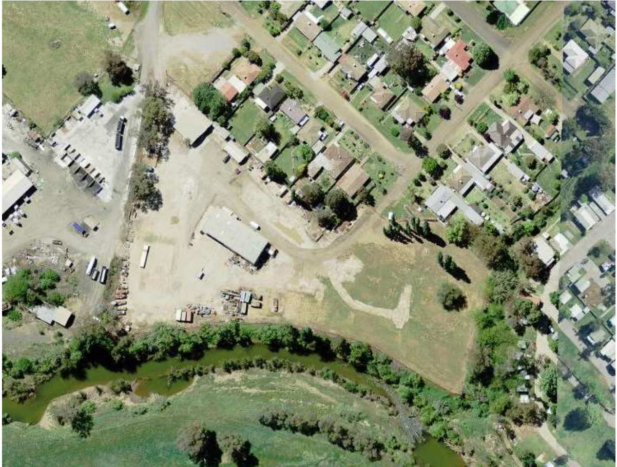
Figure 7: Aerial image of the site.

It is understood that this land use ceased in the early 2010s and remediation works have been undertaken on the site. This resulted in the location of capped bund in the western portion of the site ( Figure 2 ).