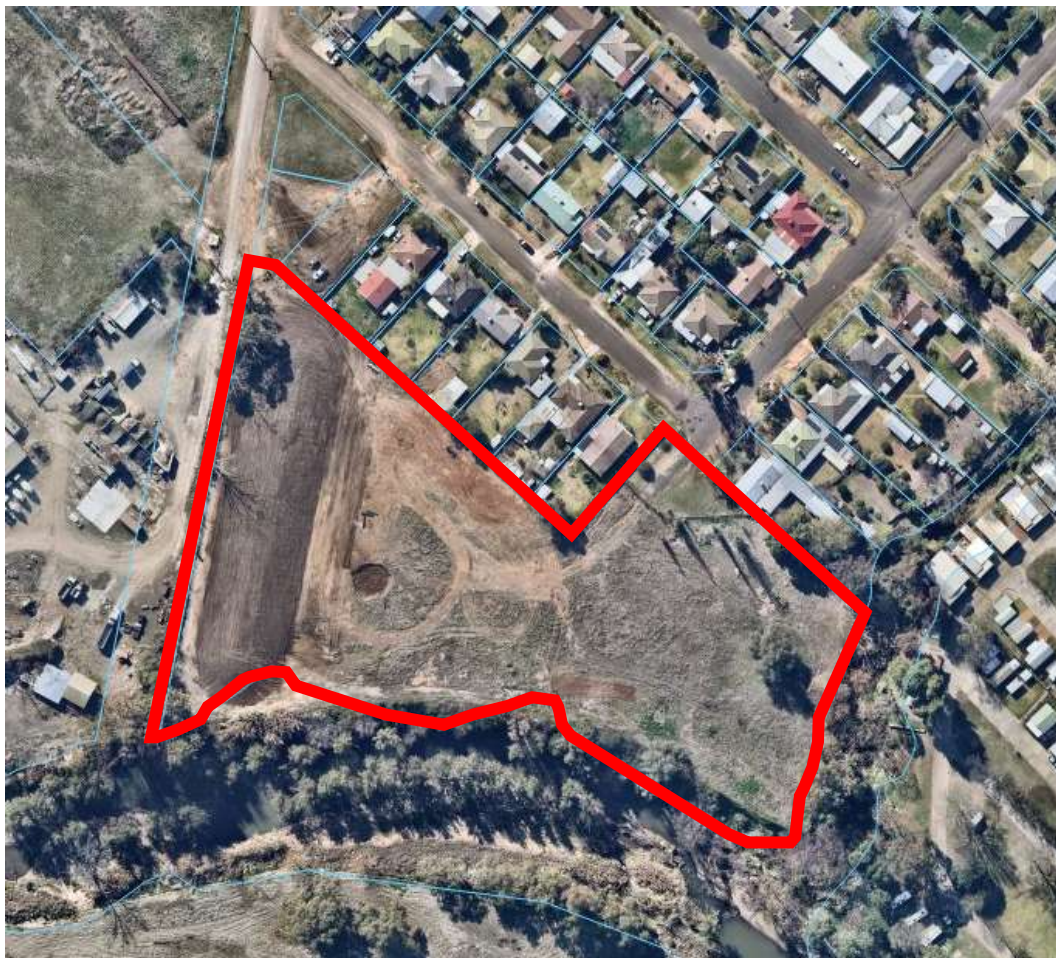
Figure 1: Aerial image of site area.

The site is irregular in shape and has a total area of 2.186 Hectares, as shown in Figure 1 and Figure 2 below. The site is predominantly flat, and slopes from the north-eastern corner (RL 389m AHD) towards the south-western corner (RL 386m AHD).